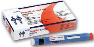
Expensive Package: Repatha dosage

While health researchers report that Amgen Inc. 's cholesterol medication Repatha reduces the risk of heart disease, economic investigators find that insurers don't want to pay the steep price for the first-in-its-class drug.